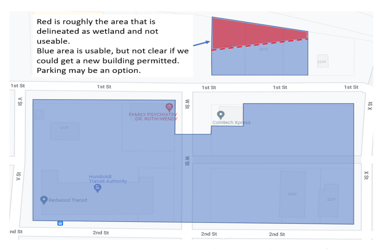
Figure 1: Property owned by HTA is shown in blue. The red shaded area (also owned by HTA) indicates portion of property that is not usable.